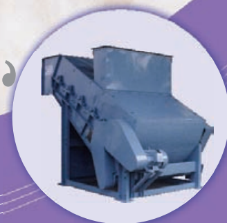
5 Cylinder Pre-Cleaner