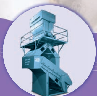
With Air Separator & Bypass