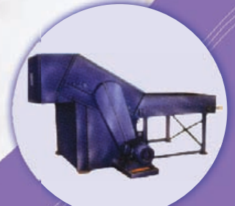
With Feeding Belt