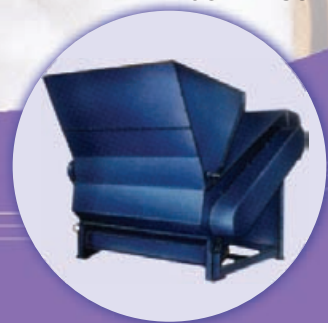
For Manual Feeding