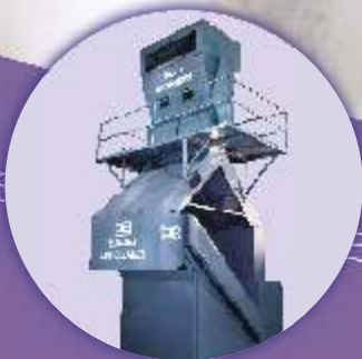
With Air Separator & Bypass