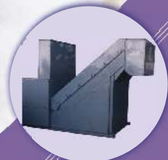
6 Cylinder Lint Cleaner

“Quality is never an accident. It is the result of an intelligent effort. There must be a will to produce a superior thing.” - JOHN RUSKIN