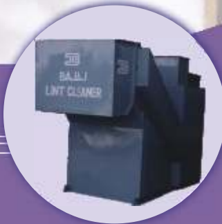
3 Cylinder Lint Cleaner