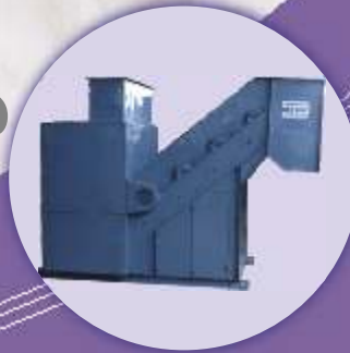
4 Cylinder Lint Cleaner